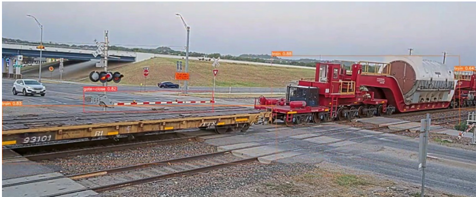
Figure 1. Live blocked grade crossing detection in Nolanville, Texas.

The camera provides all data for the system.